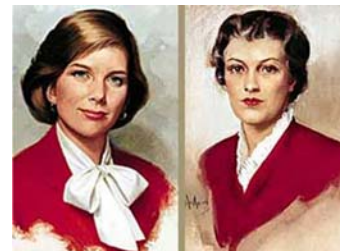
Left: "Betty" in 1986. Right: "Betty" in 1936.