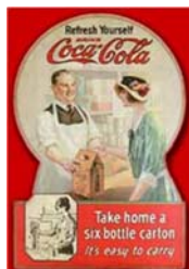
Pharmacists sold Coke in early advertisements.