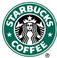
Decent Exposure: Today's Starbuck's logo.

Starbucks started as a single store on Seattle's waterfront in 1971. The original owners named the brand after the coffee-loving first mate in Melville's classic novel, "Moby Dick." The logo features a stylized two-tailed cartoon "siren." The first logo featured the siren doing the "Full Monty" from the waist up, but over the years she has taken on a more conservative appearance.