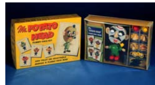
BYOP "Bring Your Own Potato": 1952 kits MINUS the plastic potato body.

Starbucks started as a single store on Seattle's waterfront in 1971. The original owners named the brand after the coffee-loving first mate in Melville's classic novel, "Moby Dick." The logo features a stylized two-tailed cartoon "siren." The first logo featured the siren doing the "Full Monty" from the waist up, but over the years she has taken on a more conservative appearance.